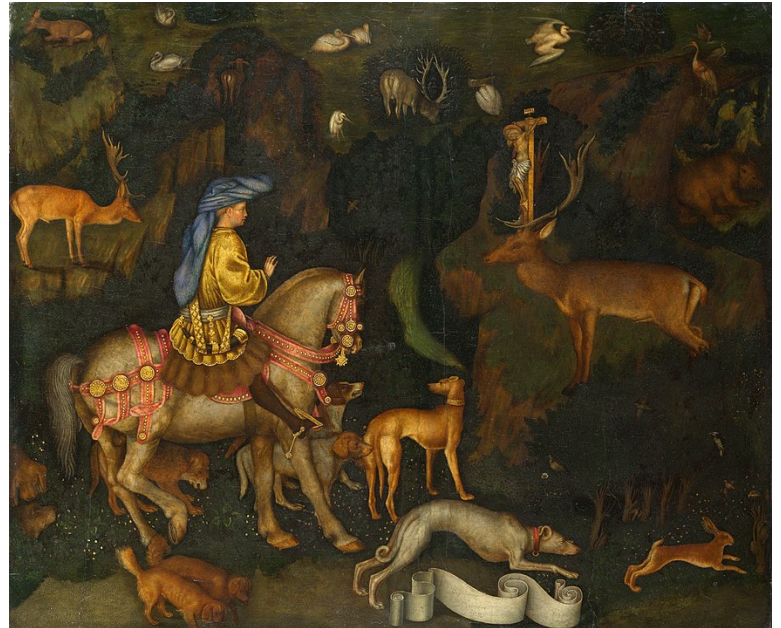
The Vision of St. Eustace. Painting by Pisanello.