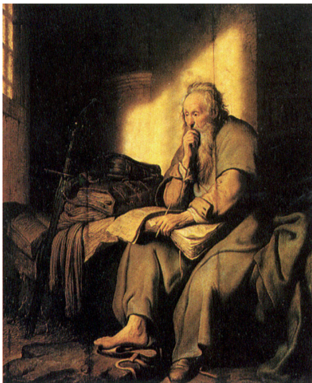
Apostle Paul in Prison. Painting by Rembrandt

3. Produce signed, dated, unredacted copies of all documents Pfizer submitted to the FDA to comply with the terms of each applicable regulation between January 2020 and the present.