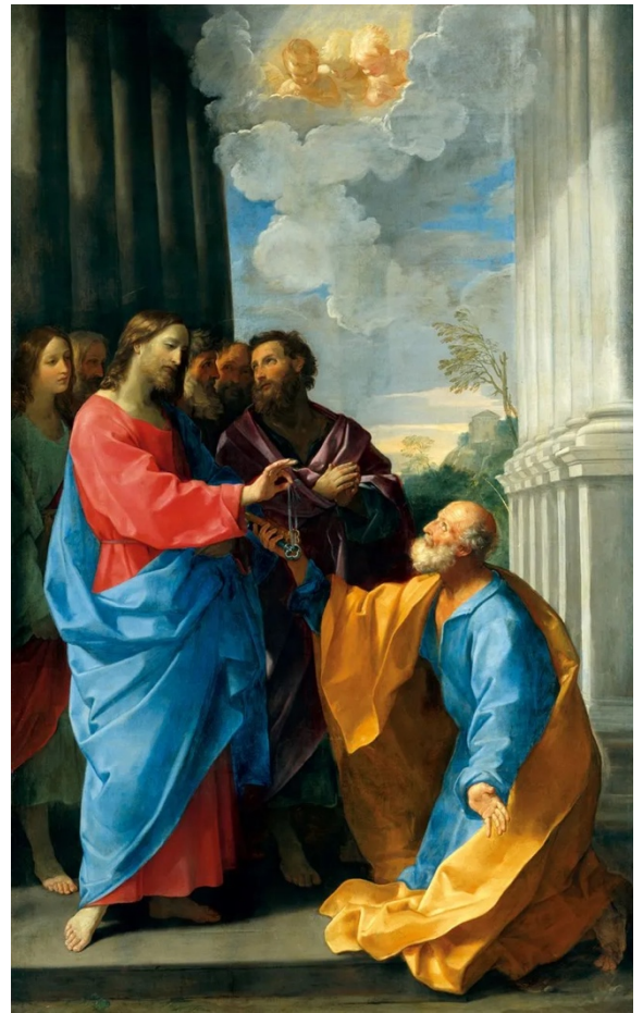
Christ Giving the Keys to St. Peter. Painting by Guido Reni.

If you are Catholic, or on the path to becoming Catholic, I encourage you to pray Rosaries to the Blessed Virgin Mary for these intentions, and novenas seeking the intercession of saints to whom you have particular devotion.