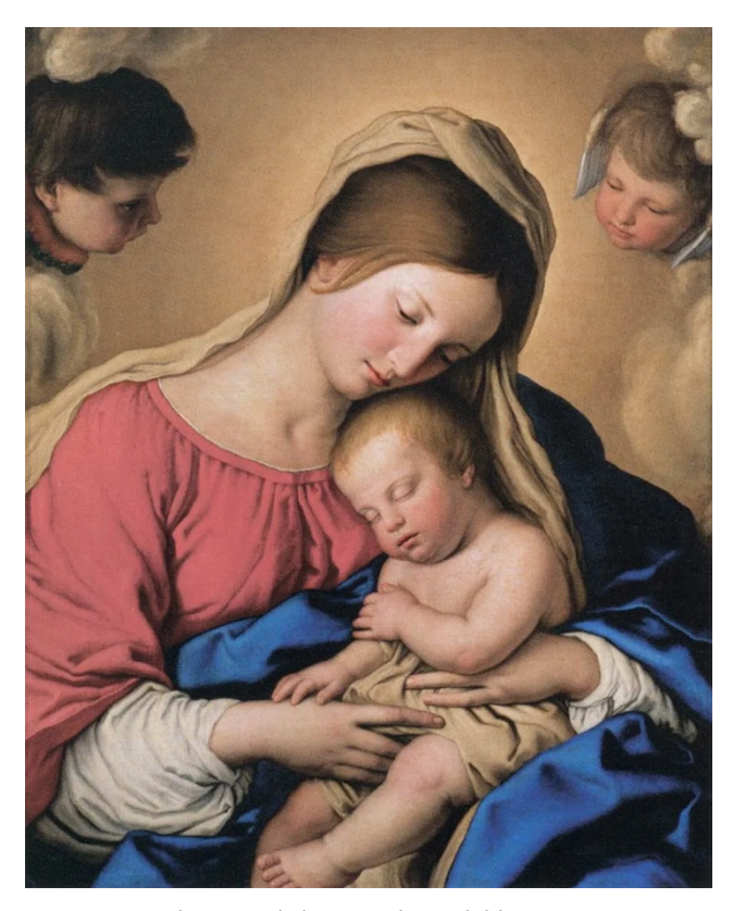
Madonna and Sleeping Christ Child. Painting by Giovanni Battista Salvi da Sassoferrato

I did a very bad job on early treatment in a lot of ways, encourage others to do better and to stock up on the over-the-counter things before you need them.