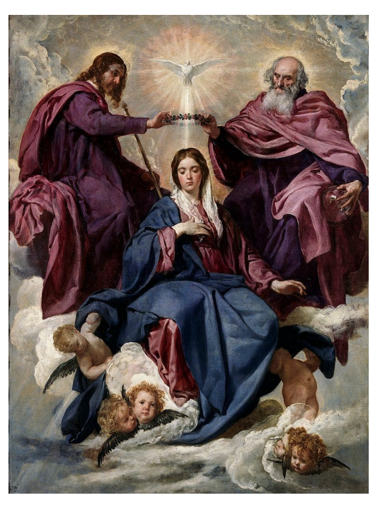
Coronation of the Virgin. Painting by Diego Velazquez.

And it's also important to work very, very hard to see to it that our legal and governing systems are set back on a path of justice after their long sojourn in the wilds of corruption and iniquity, and that the military-medical crime spree is brought to an end.