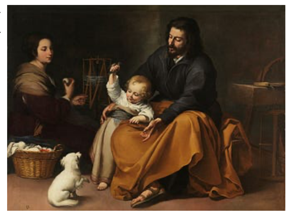
The Holy Family with a little bird. By Bartolomé Esteban Murillo.