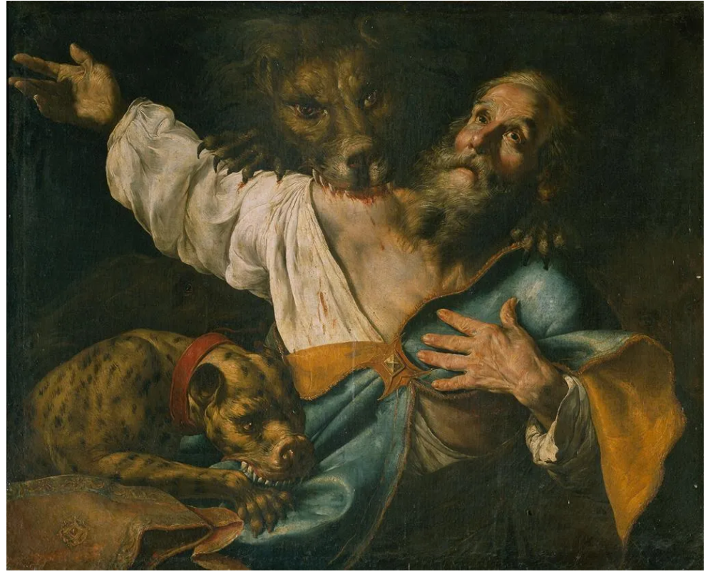
Martyrdom of St. Ignatius of Antioch. Neapolitan School of Painting, possibly Cesare Fracanzano

While we pray and work and wait for God to move those county officials to reclaim their God-given authority to protect the God-given rights of human beings to live free of government murder, surveillance, manipulation and control — the condition formerly known as slavery — the Affidavit of Noncompliance is a two-page document that anyone can print, sign and take to their county courthouse to file.